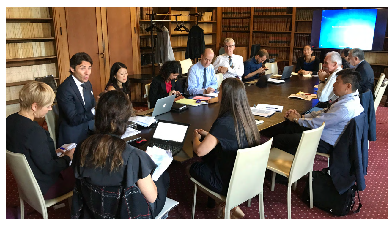
P4H Steering Group members discussing the Turnkey Network Tool to help set up global health networks

The French Ministry of Foreign Affairs hosted the P4H Steering Group Meeting in Paris from 18-19 September 2018. The meeting reviewed P4H activities for 2017-2018 and fully supported the development of the new P4H digital platform as the work space of the Network.