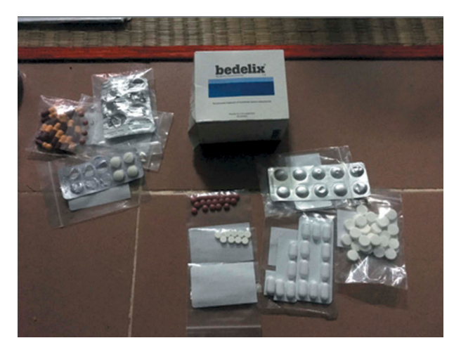
Figure 2. Medicines sold to an enteric fever patient.

Another example involving skill are white blood cell counts to indicate infection, which are in low-resource settings often performed with a hemocytometer and microscope whereby the number of blood cells is counted manually. However, for reliable results, laboratory staff need a keen eye and must be highly skilled to differentiate white from red blood cells. As a medical doctor in Phnom Penh explains: