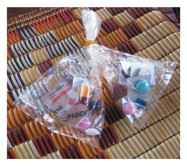
Figure 1. Antimalarial cocktail.

In the public sector the first-line antimalarials are theoretically made available for free, however, the mefloquine in these combination therapies can produce strong side-effects (Price et al., 1999). To reduce the impact of these side-effects, patients sought intravenous perfusion or drug cocktails from the private sector. Although private providers also openly