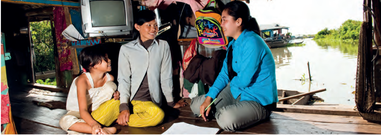
Family in Cambodia benefiting from UHC reform.

to work together intensively and to test out ideas outside their normal daily roles. Participants are challenged to examine their existing views and to deepen their understanding of others' values, needs, beliefs and interests. Over the course of L4UHC, participants learn, among other skills, to: