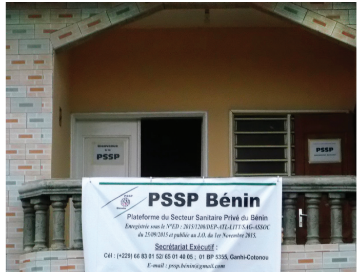
Headquarters for The Benin Private Health Sector Platform

The private health sector in Benin has grown significantly over the past 20 years and is recognized as an important player in service delivery in Benin’s health sector national development plan (2009-2018). In 2013, USAID’s Strengthening Health Outcomes through the Private Sector (SHOPS) project conducted an assessment of Benin’s private health sector, highlighting both the strengths and the weaknesses inherent in this sector. 1 Per the assessment findings, the sector has (i) a regulatory framework that’s not conducive to growth, (ii) weaknesses in the general administration of health institutions (iii) limited capacity or lack of conformity with clinical standards, (iv) weak ties to the public sector and (v) high costs. This situation limits equal access to health services despite the operational capacity for the private health sector to cover 66% of health services (compared to 65% for the public health sector). 2 The SHOPS project also conducted a census on Benin’s private