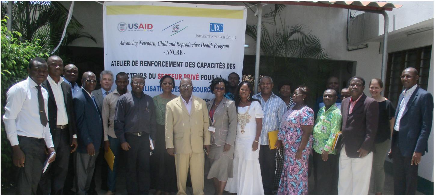
May 2017 PHSP resource mobilization workshop participants

practices, including approximately 1,500 unregistered facilities, and identified over 10,000 providers working in private facilities and nearly 2,900 in non-pharmacy facilities. The census also showed that 55% of the facilities are located in rural areas; 77% offer one or more component of the maternal, neonatal, and child health (MNCH) set of services; and 16% are affiliated to an NGO or other organizations.